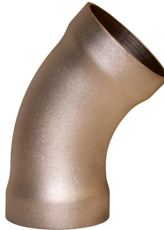
90/10 CUNI (ALLOY C70600)