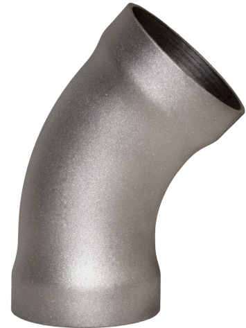
70/30 CUNI (ALLOY C71500)