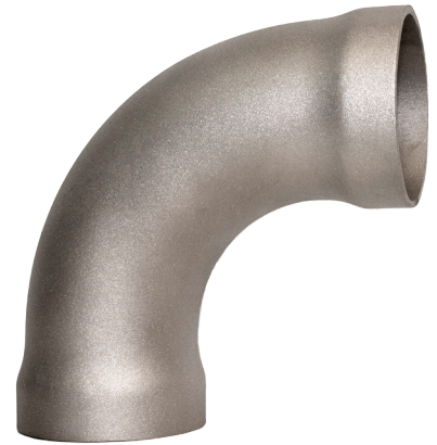
70/30 CUNI (ALLOY C71500)