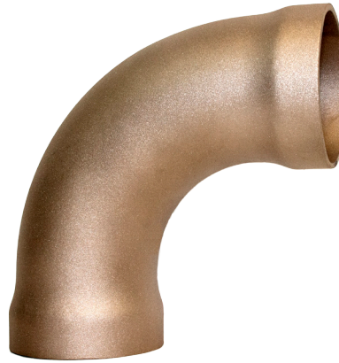
90/10 CUNI (ALLOY C70600)