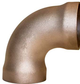
90/10 CUNI (ALLOY C70600)