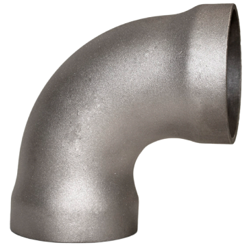
70/30 CUNI (ALLOY C71500)