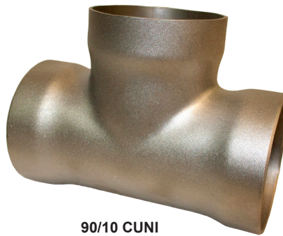
90/10 CUNI (ALLOY C70600)