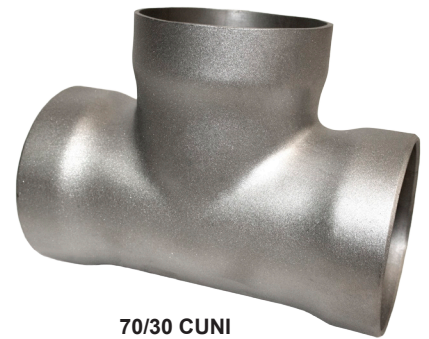
70/30 CUNI (ALLOY C71500)