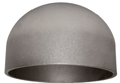
70/30 CUNI (ALLOY C71500)