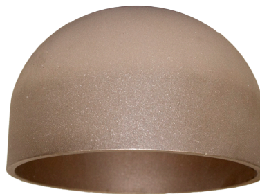
90/10 CUNI (ALLOY C70600)