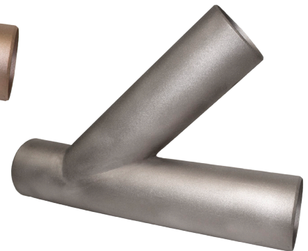
70/30 CUNI (ALLOY C71500)