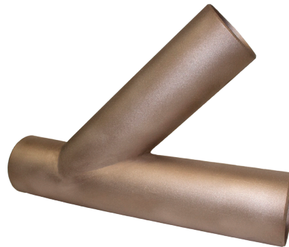
90/10 CUNI (ALLOY C70600)