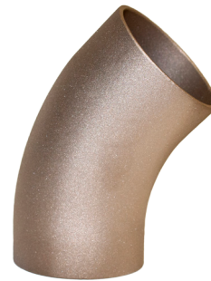
90/10 CUNI (ALLOY C70600)