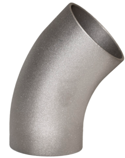
70/30 CUNI (ALLOY C71500)