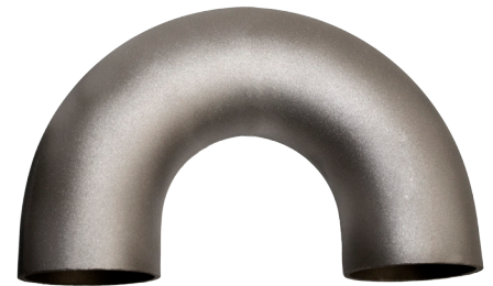
70/30 CUNI (ALLOY C71500)