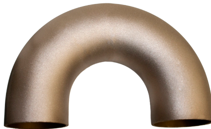
90/10 CUNI (ALLOY C70600)