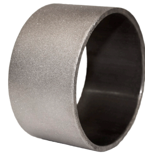
70/30 CUNI (ALLOY C71500)