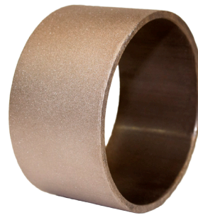
90/10 CUNI (ALLOY C70600)