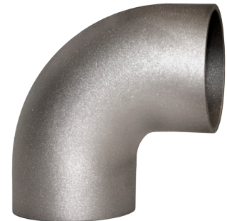
70/30 CUNI (ALLOY C71500)