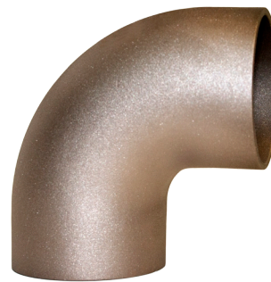
90/10 CUNI (ALLOY C70600)