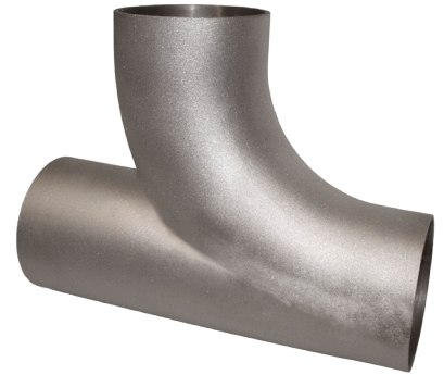
70/30 CUNI (ALLOY C71500)