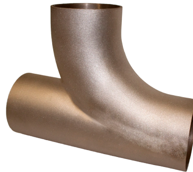
90/10 CUNI (ALLOY C70600)