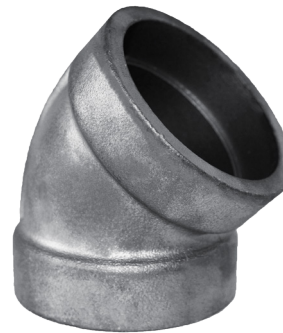
70/30 CUNI (ALLOY C715/C964)