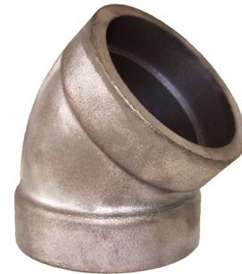
90/10 CUNI (ALLOY C706/C962)