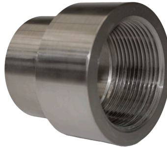
70/30 CUNI (ALLOY C715/C964)