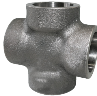
70/30 CUNI (ALLOY C715/C964)