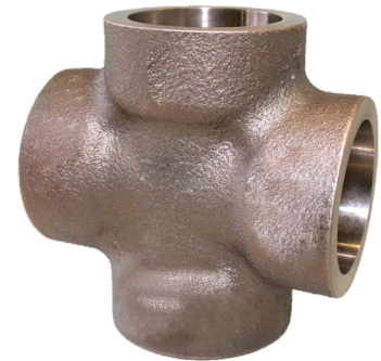
90/10 CUNI (ALLOY C706/C962)