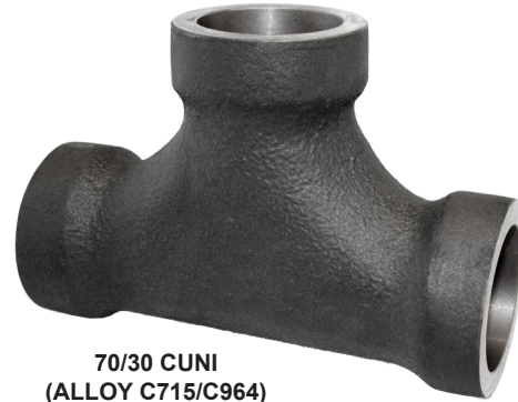
70/30 CUNI (ALLOY C715/C964)