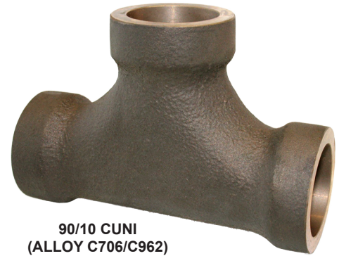
90/10 CUNI (ALLOY C706/C962)