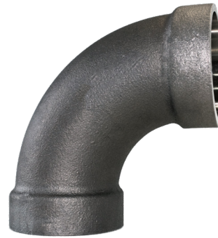
70/30 CUNI (ALLOY C715/C964)