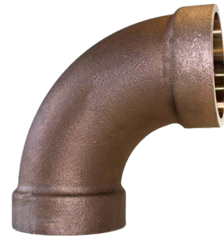
90/10 CUNI (ALLOY C706/C962)