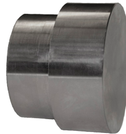
70/30 CUNI (ALLOY C715/C964)