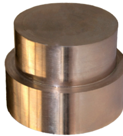
90/10 CUNI (ALLOY C706/C962)