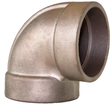
90/10 CUNI (ALLOY C706/C962)