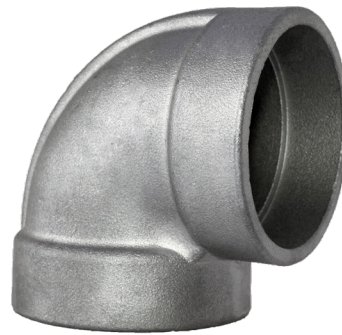
70/30 CUNI (ALLOY C715/C964)