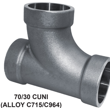
70/30 CUNI (ALLOY C715/C964)