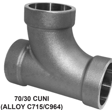
70/30 CUNI (ALLOY C715/C964)