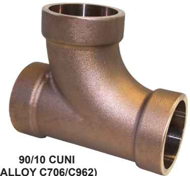
90/10 CUNI (ALLOY C706/C962)