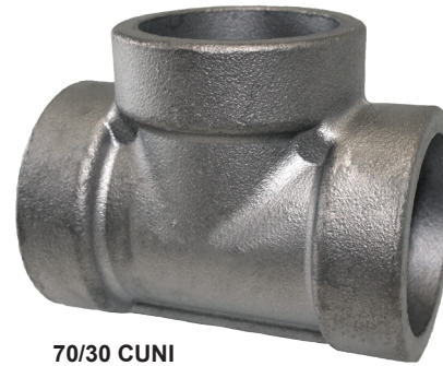
70/30 CUNI (ALLOY C715/C964)