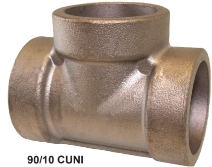
90/10 CUNI (ALLOY C706/C962)