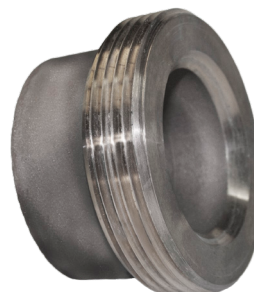
70/30 CUNI (ALLOY C715/C964)