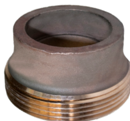
90/10 CUNI (ALLOY C706/C962)