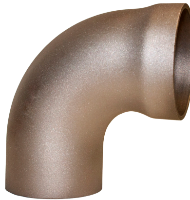
90/10 CUNI (ALLOY C70600)