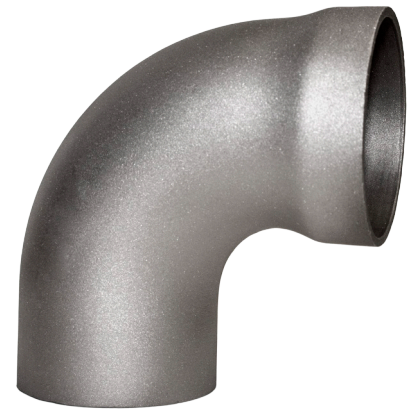
70/30 CUNI (ALLOY C71500)