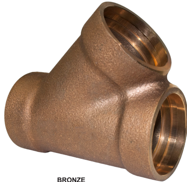
BRONZE ASTM B61 / QQ-C-390 / MIL-B-16541 (ALLOY C90300 / C92200)