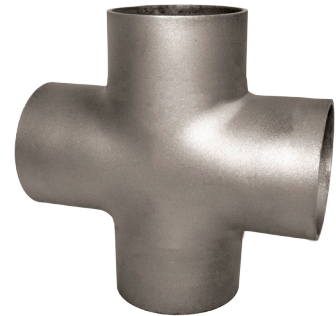
70/30 CUNI (ALLOY C71500)