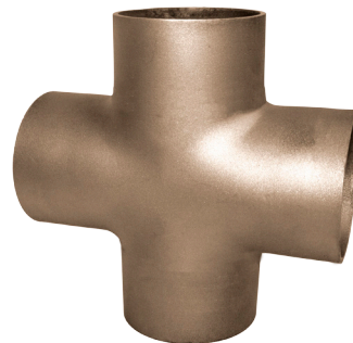
90/10 CUNI (ALLOY C70600)