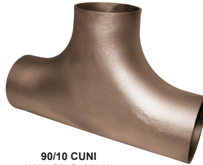
90/10 CUNI (ALLOY C70600)