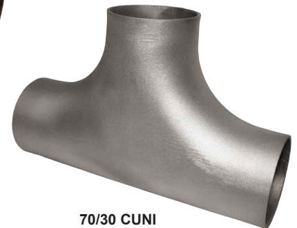
70/30 CUNI (ALLOY C71500)