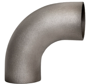
70/30 CUNI (ALLOY C71500)