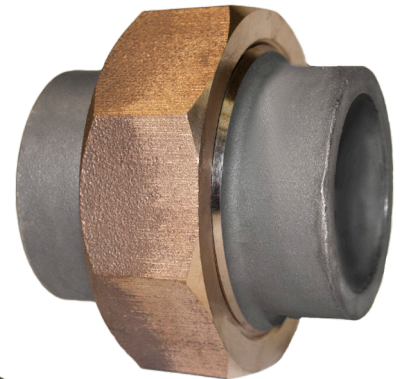
70/30 CUNI (ALLOY C715/C964)